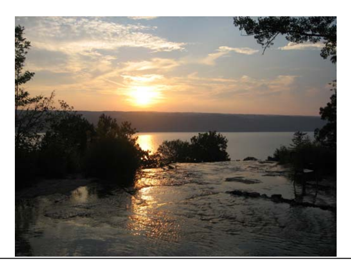
View from Hector Falls below Route 414, looking west (2008)

Natural features such as lakes, gorge, glens, and waterfalls are equally picturesque. Nineteenth-century artists and tourists with "pencil" and camera sought out such natural wonders throughout New York State, including iconic Niagara Falls,