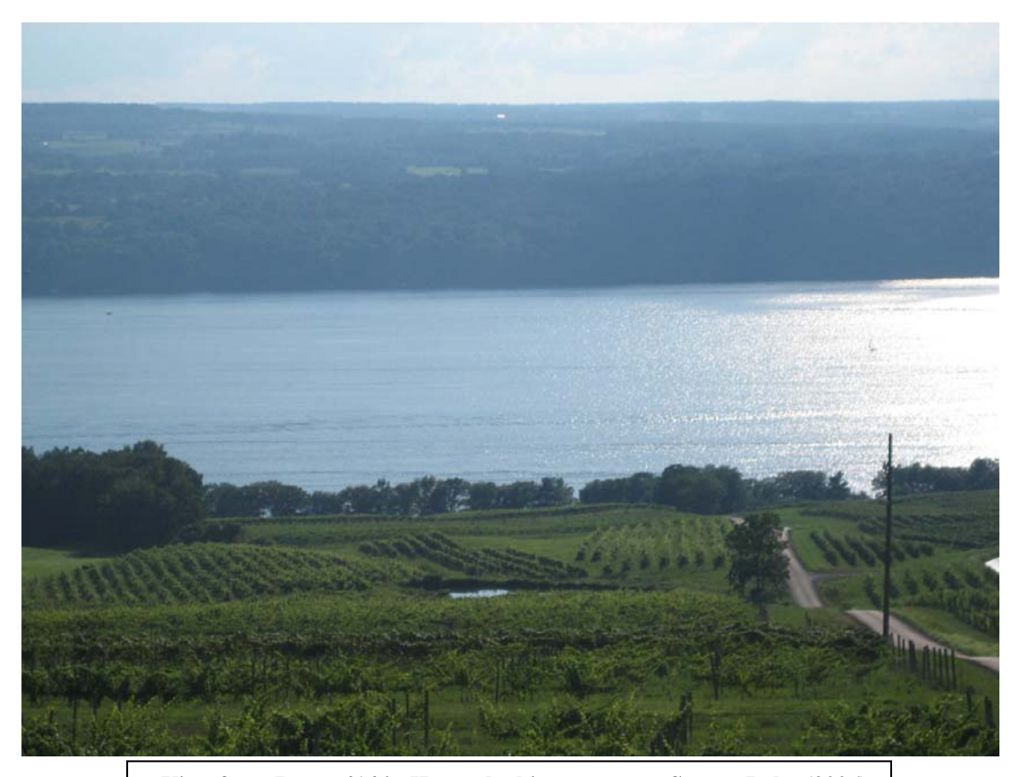
View from Route 414 in Hector looking west over Seneca Lake (2006)

natural forms. Scenic views of working vineyards cascading down steep slopes towards glistening pure lakes meld with rural farmsteads, orchards and small villages and towns. It is a relatively open countryside interspersed with rather small, nucleated settlements. The rolling topography offers scenic views both dramatic and pastoral, a humanized landscape where community character has been shaped by a deep history and current substantial progress in heritage- and agri-tourism.